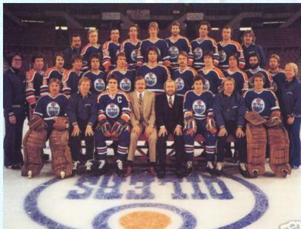
1979-80 Edmonton Oilers

(Warning: Flames & Stampeders fans may want to skip to the next paragraph!) Right in 1979 the Edmonton Oilers joined the National Hockey League, and boy, was the next decade a great time to be an Edmonton sports fan! Five years after their establishment, the Oilers obtained their first Stanley Cup win. That same year, 1984 was the first time Edmonton hosted the Grey Cup. Three years later, the Oilers won the Stanley Cup and the Eskimos won the Grey Cup. You can still hear the die-hards talking about 1987 in the oldest sports bars.